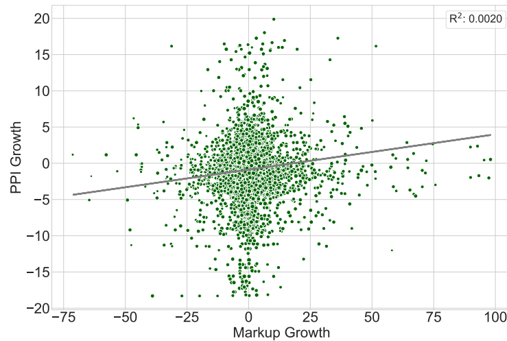
Figure 2: Annualized Changes in Markups and Prices, 1980-2019

Notes: The figure shows the PPI CAGR (vertical axis) and markup CAGR (horizontal axis) for firms in the matched samples. The line of best fit is estimated with weighted least squares, using CPI-adjusted sales for the period closest to 2019. I exclude 17 firms with PPI or markup growth outside the range of the axes.